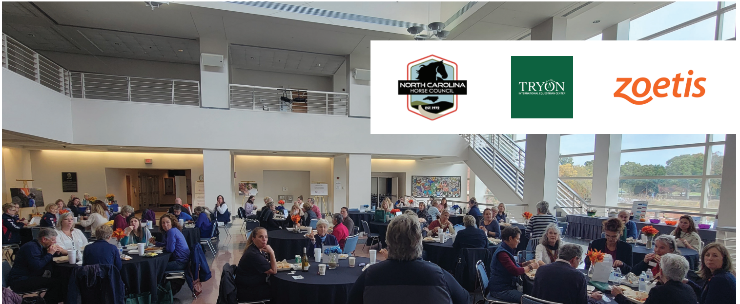
Horses and Humans Research Foundation “Connect, Learn and Inspire” conference, 2021

In October 2021, the first HHRF academic conference was held at the Isothermal Community College in Spindale, NC. A little under 100 people attended this day and a half long conference, which offered multiple tracks as well as keynote presentations. Attendees were enthusiastic about attending future conferences hosted by HHRF. This would not have been possible without the backing of supporters like Zoetis and North Carolina Horse Council. Future plans include holding a second HHRF conference in Summer/Fall 2022 and partnering with PATH International to hold a pre-conference in October 2022.