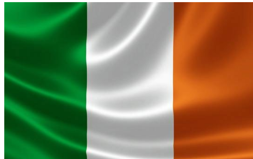
Irish National HEIR Register Launched in 2021

Development of National Registers for Equine Assisted Practitioners – a pilot project