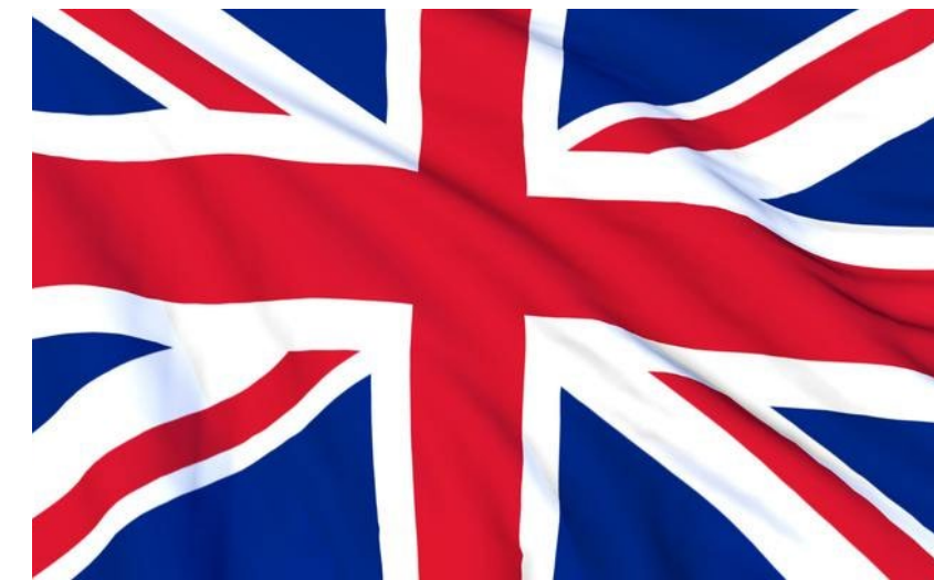
RDA UK National HEIR Register Launched May 2022